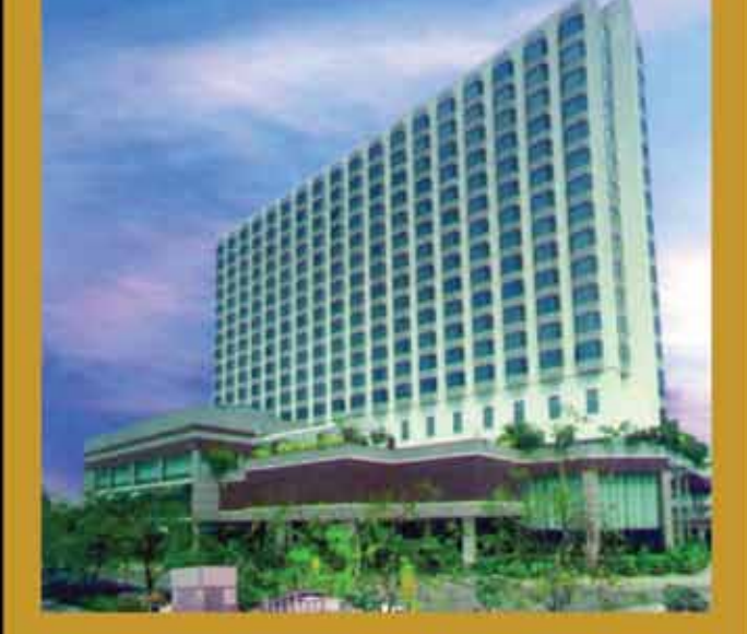
Welcome to the real world of Thai Hospitality

402 first class rooms, suites and Executive Floors 5 well appointed restaurants and 2 bars FREE broadband (2Mbs) and Wi Fi Internet