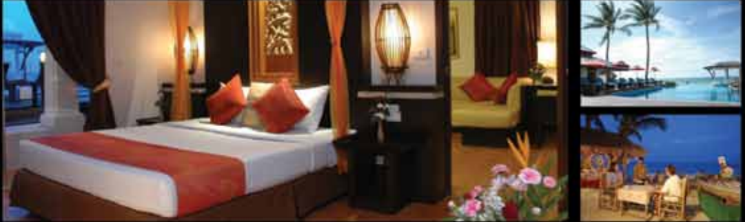
AL'S RESORT - CHAWENG BEACH, KOH SAMUI