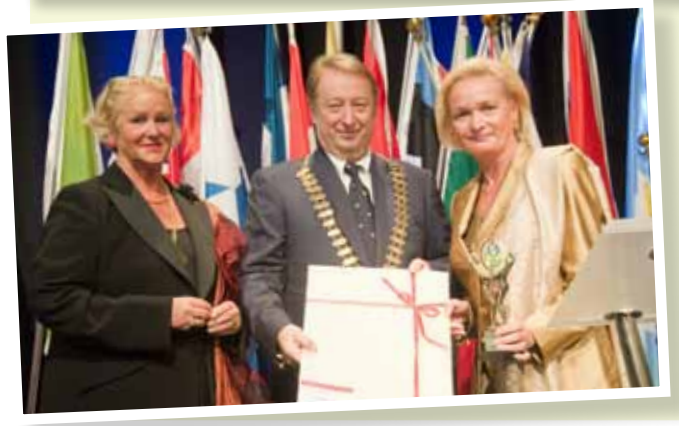
6. In the category of Educational Programmes – Media: REISEPAVILLON - Germany www.reisepavillon-online.de