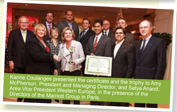
7. In the category of Global Corporate Establishments: MARRIOTT INTERNATIONAL GREEN ATTITUDE France - www.marriott.fr