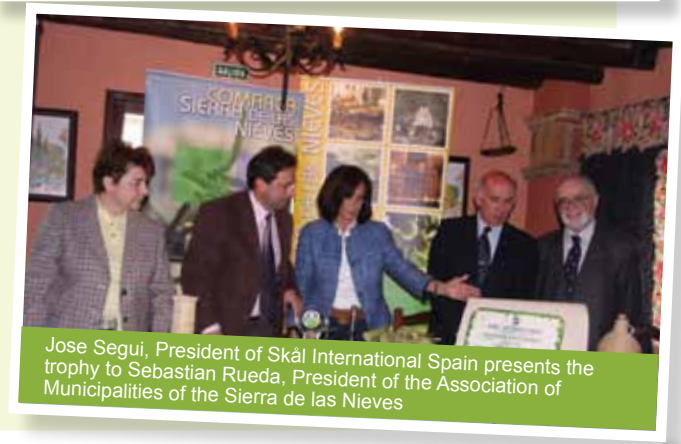
SIERRA DE LAS NIEVES-STRONG COMMITMENT TO SUSTAINABLE DEVELOPMENT - Spain www.sierranieves.com