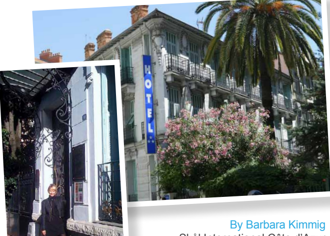
Skål International Côte d'Azur

The Skål spirit is very much in tune with the current era, and we should be firmly committed to cultivating it with a strong sense of friendship.