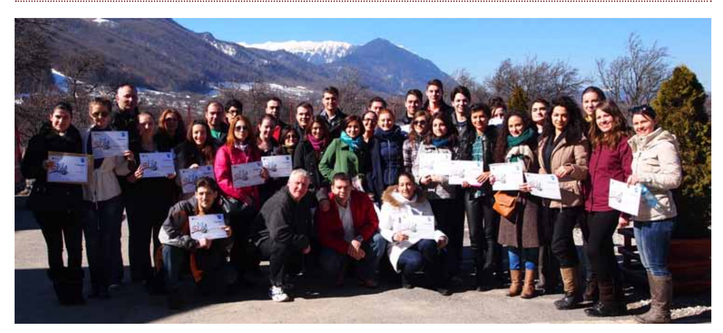
Skål International Bucharest now has the first official category of Young Skål members in Romania.

The members are young people (a good mix of professionals and promising students) with ambitions and enthusiasm for the future of the Romanian tourism industry, looking forward to establishing new relationships and networks with Young Skål at an international level.