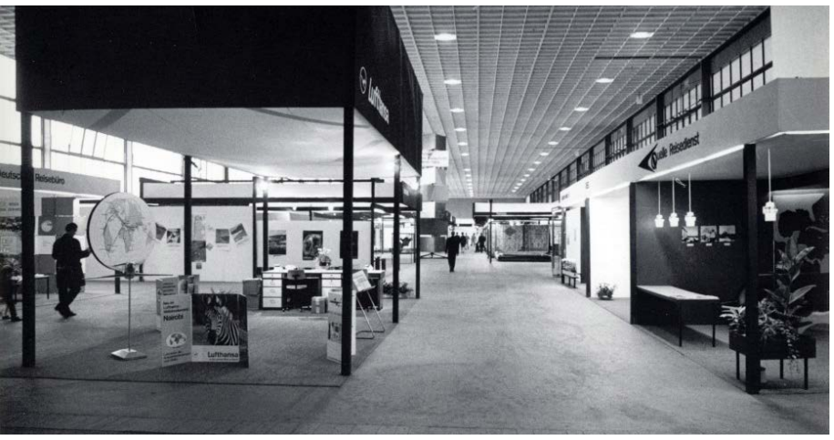
ITB Berlin 1966

Visitors can follow this trip and other encounters on the website at www. itb5O.com as well as on Facebook and Twitter. Furthermore, a book