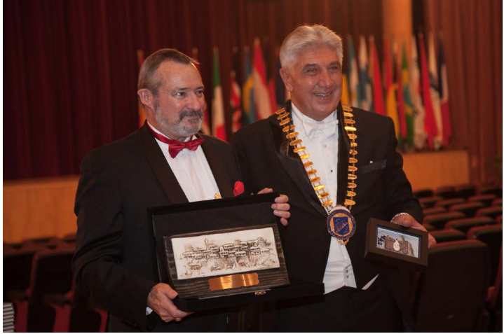
The Gala Dinner marked the end of a very successful Skål World Congress.