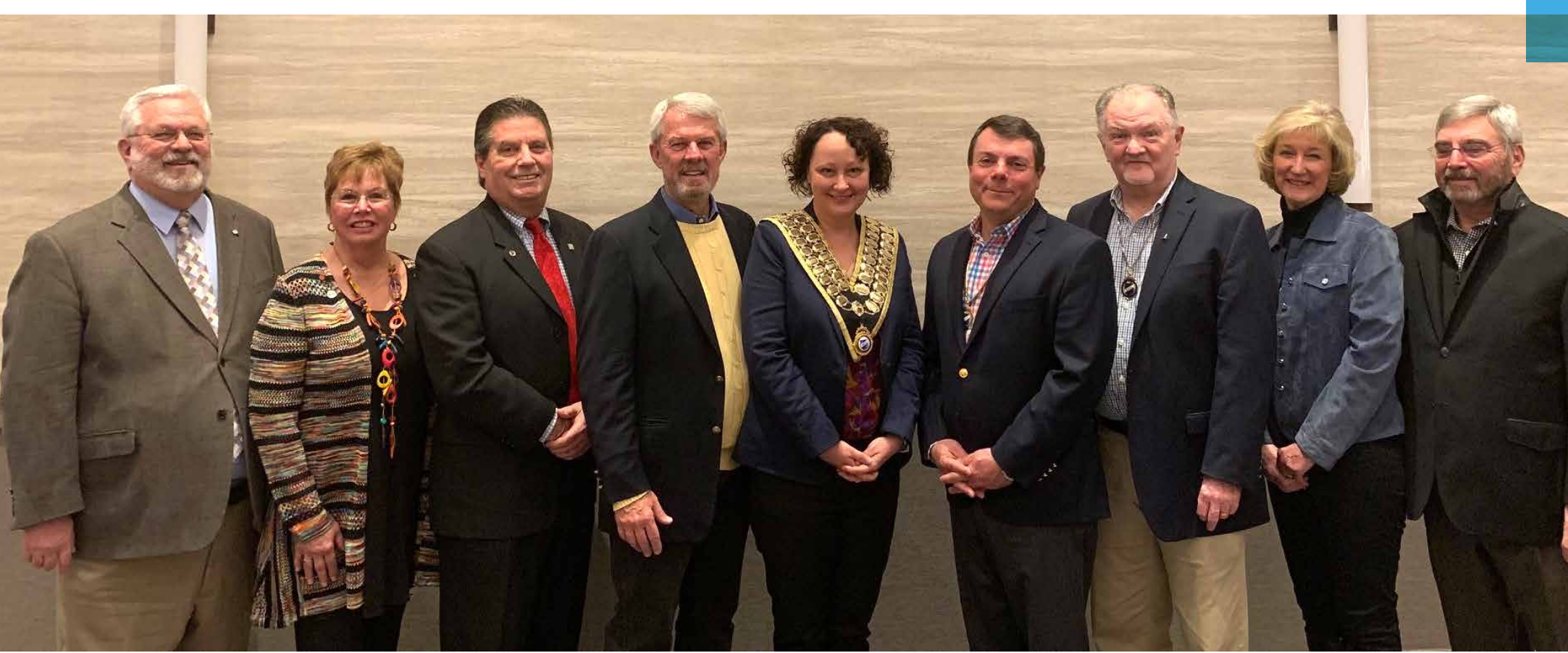
2019 Skål USA Executive Committee and Auditors